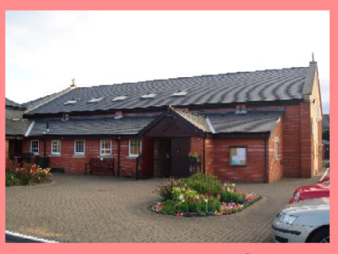
Immaculate Heart of Mary