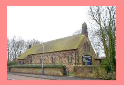
St. John's Backworth