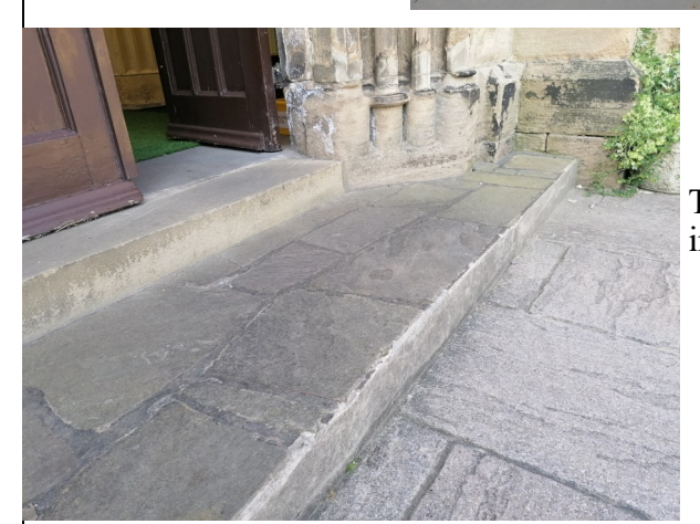
The two stone steps up into the church

How wonderful that wheelchairs and buggies will now be able simply to roll unhindered into church.