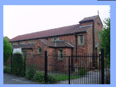
Our Lady & St. Edmund, Parish of Our Lady Star of the Sea