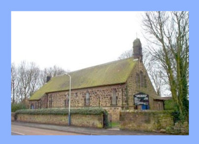
St. John's Backworth