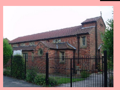
Our Lady & St. Edmund, Parish of Our Lady Star of the Sea