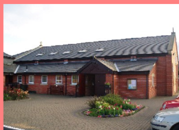
Immaculate Heart of Mary, Parish of Our Lady Star of the Sea