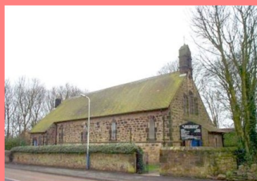
St. John's Backworth