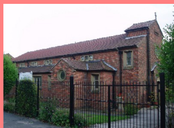
Our Lady & St. Edmund, Parish of Our Lady Star of the Sea