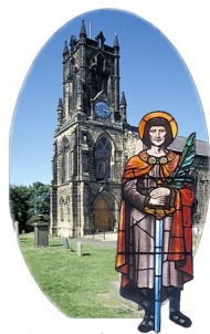
St. Alban's Earsdon