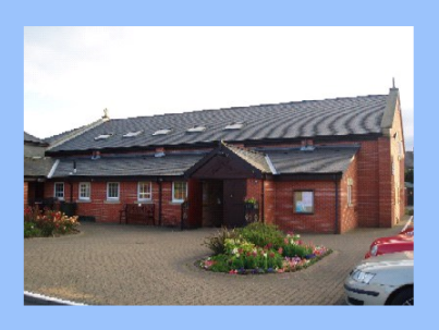
Immaculate Heart of Mary, Parish of Our Lady Star of the Sea