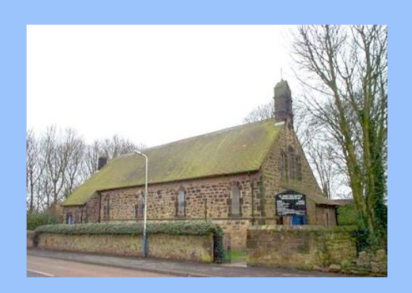
St. John's Backworth