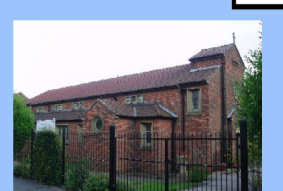
Our Lady & St. Edmund, Parish of Our Lady Star of the Sea