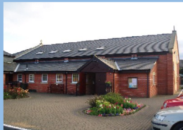
Immaculate Heart of Mary, Parish of Our Lady Star of the Sea