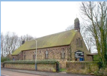
St. John's Backworth