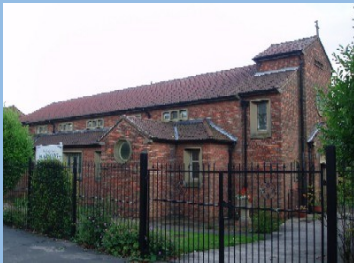
Our Lady & St. Edmund, Parish of Our Lady Star of the Sea