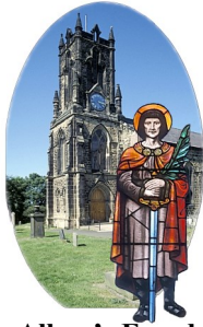
St. Alban's Earsdon