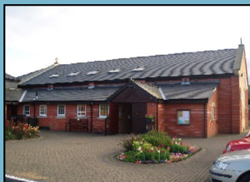
Immaculate Heart of Mary, Parish of Our Lady Star of the Sea