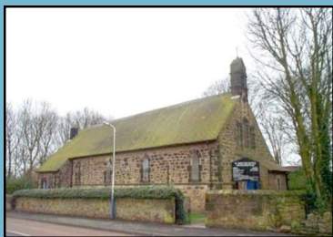
St. John's Backworth