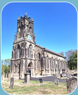
St. Alban's Earsdon